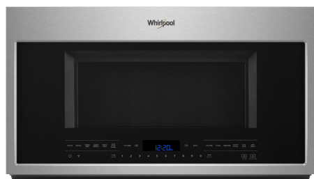
Fingerprint Resistant Stainless Steel WMH75021HZ