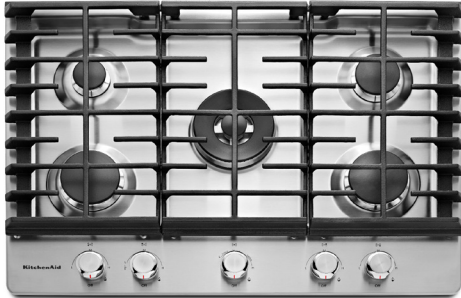
Stainless Steel KCGS550ESS