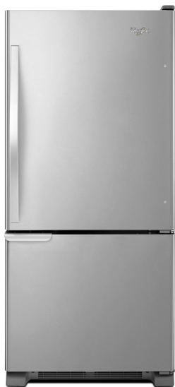
Monochromatic Stainless Steel WRB119WFBM