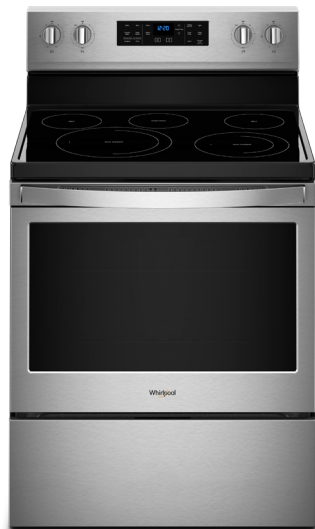
Fingerprint-Resistant Stainless WFE550S0HZ