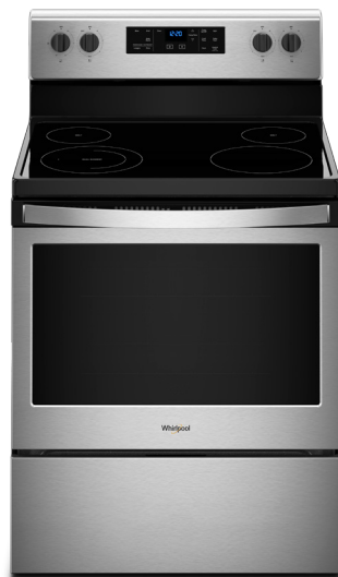
Stainless Steel WFE510S0HS