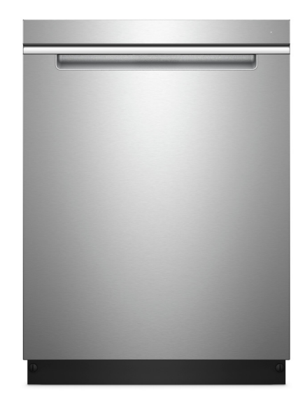
Fingerprint-Resistant Stainless Finish WDTA50SAHZ