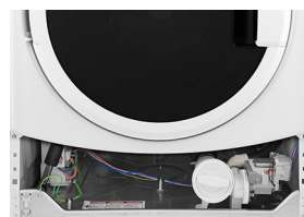
FRONT ACCESS PANEL